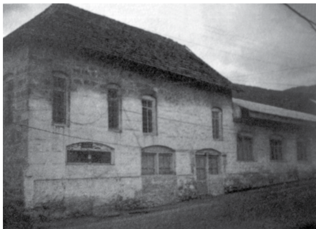
Jewish merchant house in Oguz. The beginning of the XX century

Having lived in Azerbaijan for 2,500 years without persecution and numbering some 35,000, the country's Jewish community enjoys full dignity, respect and religious freedom. As the former Israeli Ambassador to Azerbaijan, Rafi Harpaz, said unlike in European countries, there is no anti-Semitism in Azerbaijan.