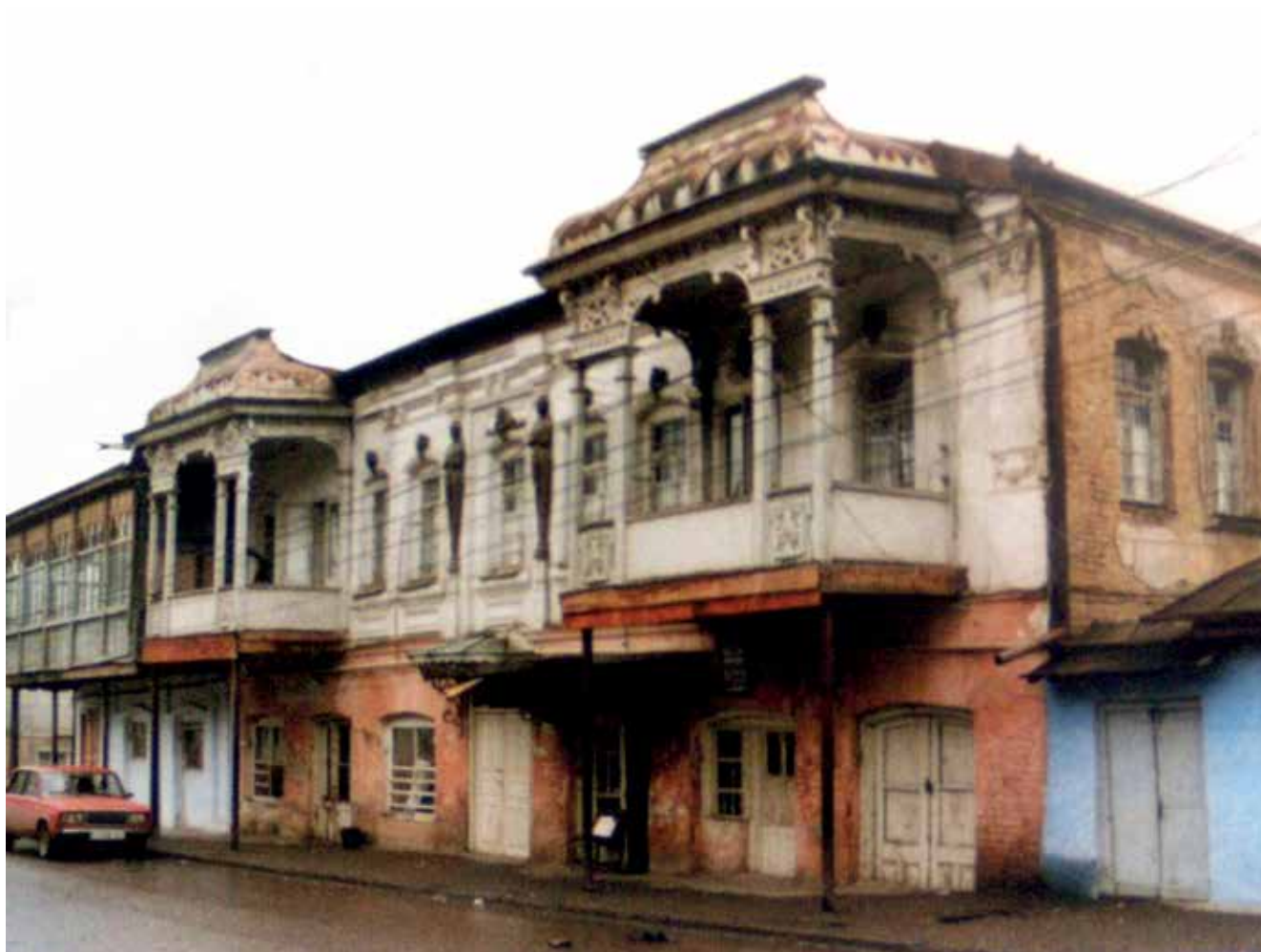
Jewish house in Guba. The beginning of the XX century

Azerbaijani-Israeli links extend beyond diplomacy to