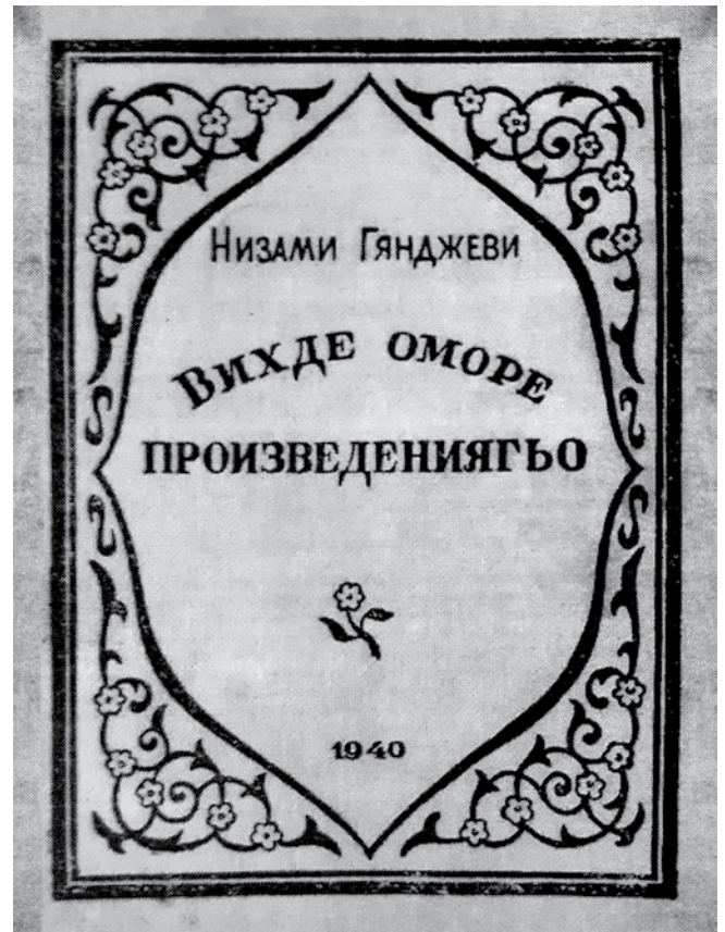
Collection of works by Nizami Ganjavi, published in the Mountain Jewish language. Baku, 1940