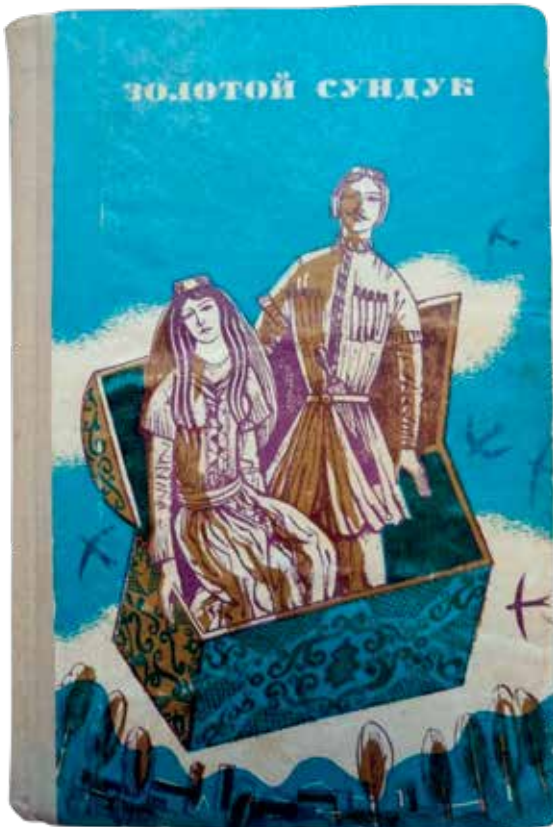
Collection of Mountain-Jewish fairy tales «Golden Chest», published in Baku