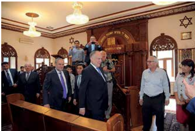
Guests from World Jewish Congress headed by Amb. Ronald Lauder at the six-domed synagogue in Guba

and the largest Jewish educational center in the South Caucasus have been built. Plans are in place for the first Azerbaijani Jewish museum, which will be the first Jewish museum in the South Caucasus.