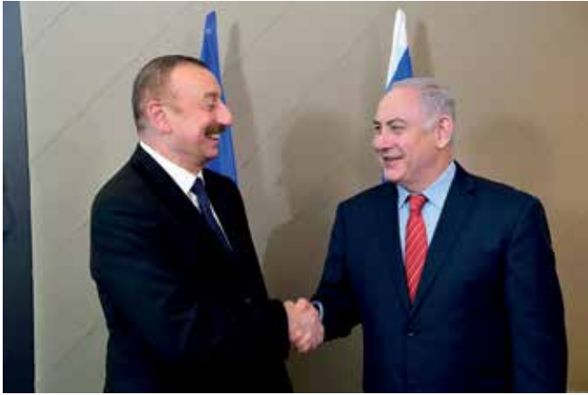
President of Azerbaijan Ilham Aliyev and 9th Israeli President Shimon Peres

It is necessary to point out the words of 9th Israeli President Shimon Peres, during his historical visit to Azerbaijan: "I know that the policy of Azerbaijan is of peace, friendship, development but also of independence. With your unique geographic location, there is no doubt that you already are, and will continue to be, a key country in this part of the world."